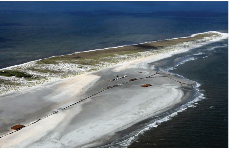
Mississippi Coastal Improvement Program (MSCIP) Beach Nourishment, Ph. III Off Gulfport / Biloxi, MS