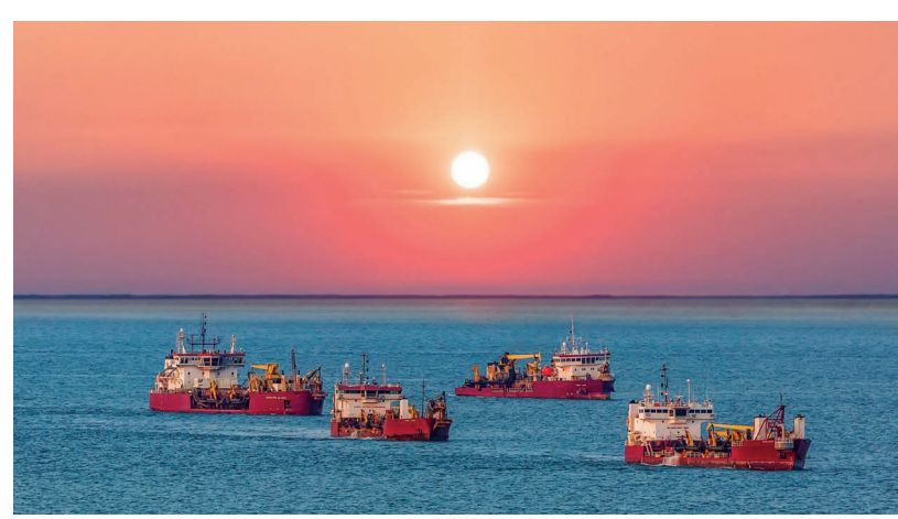
Dredges Terrapin Island, Padre Island, Liberty Island, and Dodge Island York Spit Channel, VA