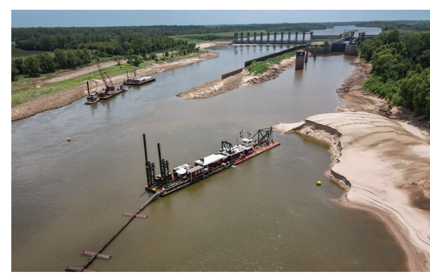
Dredge lowa Vicksburg, MS