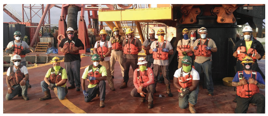
Crews from Spider Barge 175-185 and Derrick 1700 Charleston Harbor Deepening