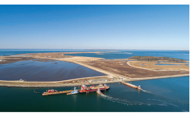
Unloader No. 2 Poplar Island, Chesapeake Bay, MD