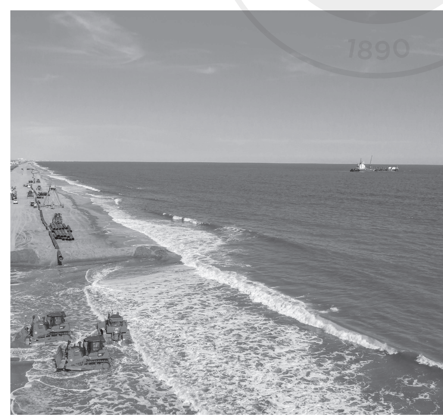
Dredge Ellis Island Offshore Pumping Emerald Isle, NC