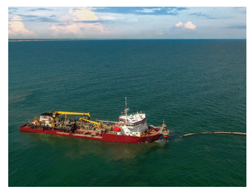
Dredge Liberty Island Great Egg Harbor, NY

Despite the challenges we faced, we are completing the year with net income from continuing operations of $66.1 million, Adjusted EBITDA of $151.1 million and a net debt balance of $107.2 million. Our strong cash flow and balance sheet, and substantial liquidity, allowed us to not only withstand the economic storm as a result of the pandemic, but positioned us well to invest in our future. In 2020, we contracted to build a new mid-size hopper dredge, we upgraded several large cutter dredges, we decided to move our headquarters to Houston to be closer to our markets and clients and we invested in our shareholders through a $75 million share repurchase program.