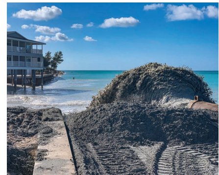
Beach Pump Out Charlotte County, FL